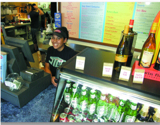
(Above): Wahoo's friendly staff will assist you in making your menu choices.